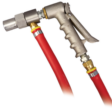
SG 300 - Portable Blast Gun with Hopper

The SG-300 system includes the hopper with abrasive metering mechanism, removable abrasive screen, 10 feet of air hose and media hose, trigger-control blast gun, air jet, and long-lasting tungsten carbide nozzle.