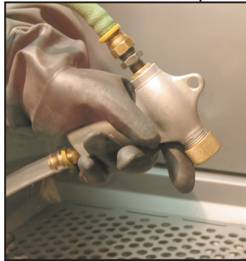
Fits the hand easily

High-production, hand-held blast cleaning gun for use in any suction blast cabinet. May be mounted in fixed position. Made from cast/machined aluminum. Gun assembly includes gun body, orifice with locknut, O-ring and nozzle holding nut. Order nozzle separately.