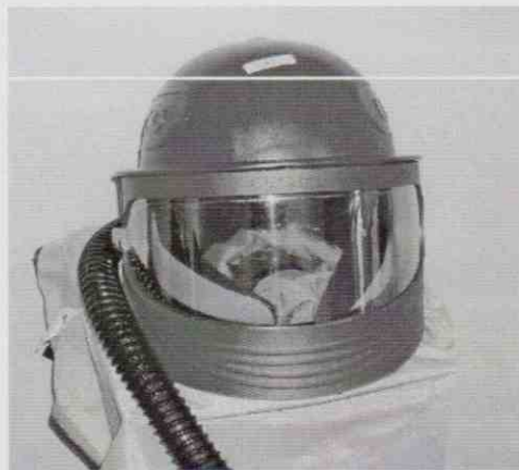
Test Item: Q1941A

These data were obtained through measurements made at the laboratories of Michael & Associates, Inc., State College, PA , USA. Michael & Associates, Inc., is accredited to test to ANSI S3.19-1974, ANSI S12.6-1997 and AS/NZS 1270:2002 by the National Institute of Standards and Technology (NIST) National Voluntary Laboratory Accreditation Program (NVLAP).