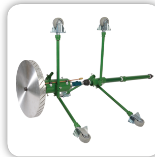
Stock No. 27024 Spin-Kote 4896