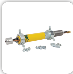
Stock No. 27020 Spin-Kote 25