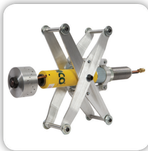
Stock No. 27021 Spin-Kote 512