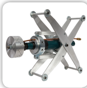
Stock No. 27022 Spin-Kote 817