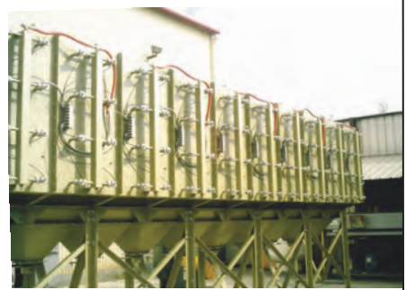
CDF-96 in process of being installed at Randolph AFB.