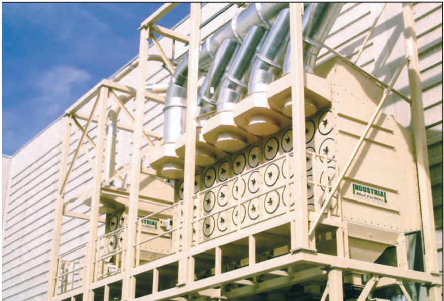
Two CDF's installed side by side at Hill AFB provide ventilation for both the recovery system and the blast room. CDF-8 on left; CDF-40 on right. Auger system transports dust to central collection area for disposal.

Dust-laden air is pulled into the filter housing