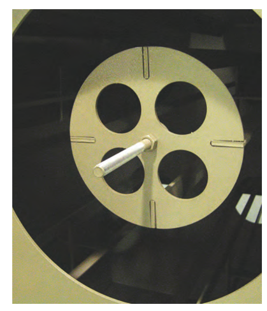
Structural steel cartridge supports self-center cartridges for easy removal and replacement.