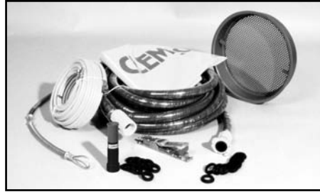
Contractor System Accessories

Field portable, high-production, single-chamber blast machine system, rated at 150 psi, for one operator. Holds 2 cubic feet of blast media. Equipped with Millennium pneumatic pressure-release remote controls. Components listed on next page.