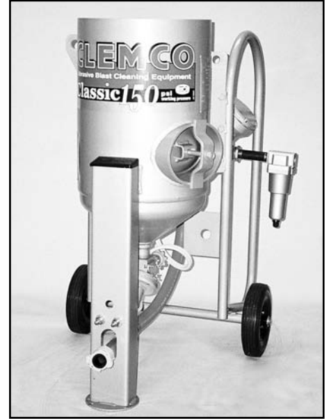
2 cu ft Contractor Blast Machine