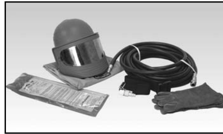
Operator Safety Equipment