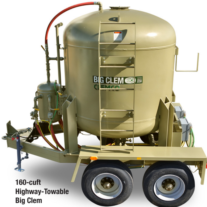
160-cuft Highway-Towable Big Clem

IMPORTANT: For safe, efficient blasting, read and follow the operations manual and seek training for everyone who will use this equipment.