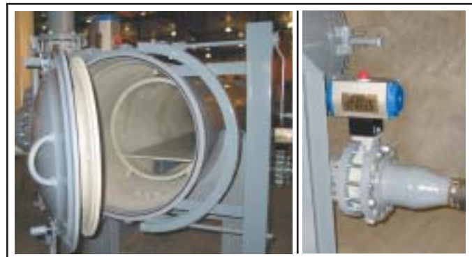
Quick-Open High Pressure Closure