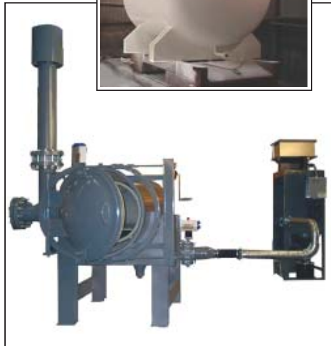
1/4-Pound Shape-Charge Test Chamber with Emission Treatment to Meet California EPA Requirements