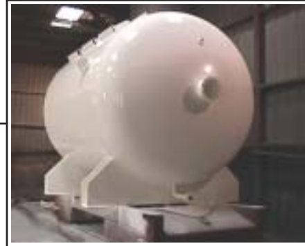
2-Pound Explosion Chamber